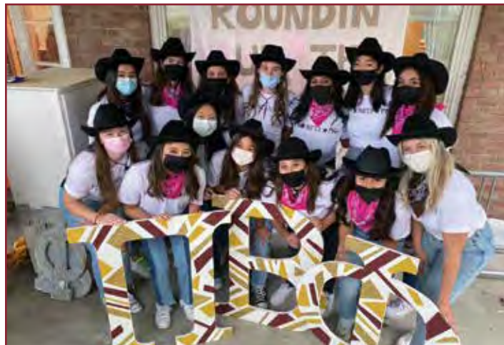
We happily welcomed our newest MC to join us on the wild ride of being a Pi Phi this Fall Bid Day

We then collaborated with Panhellenic and Cornell to coordinate an enjoyable and safe bid day for the new members in the spirit of getting our new members even more excited to be a part of our sisterhood. It rained this year on Bid Day, but the energy and excitement from our sisters generated a warmth perfect for welcoming our new members.