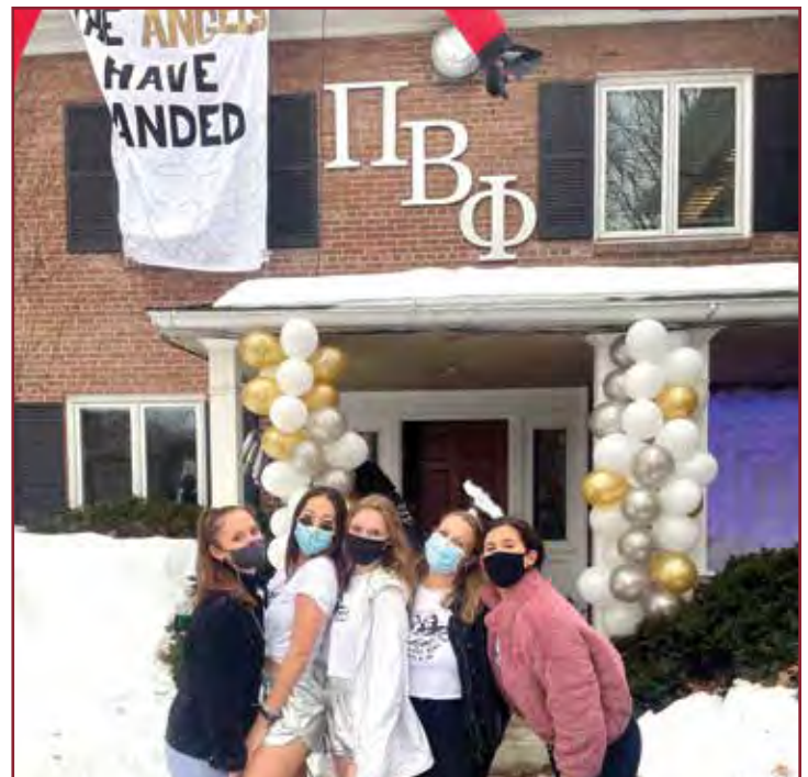
A chilly Bid Day at 330 Triphammer, spring 2021

When I first came to Cornell, I didn't know if I wanted to join a sorority. Then I (thankfully) joined Pi Phi, and ironically, I insisted that I would not want to be president. Looking back three years later, I couldn't have asked for a better experience as both a member of a sorority and as chapter president. The lessons I learned and the relationships I formed are invaluable, and I am proud to be a leader of NY Delta.