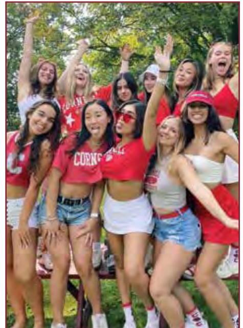
Celebrating Cornell Homecoming in the 330 Triphammer backyard