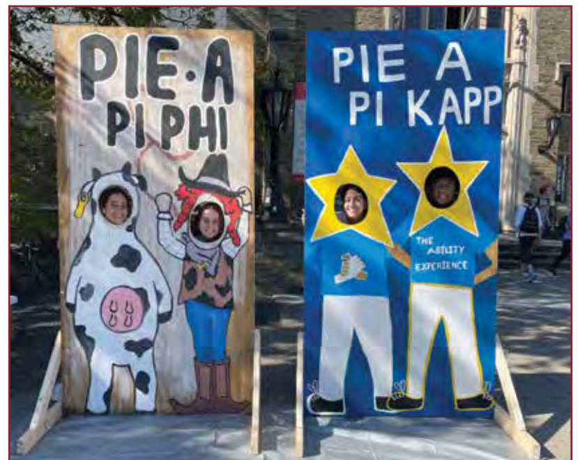
Three Pi Phis and one Pi Kapp crack a smile moments before a delicious disaster!