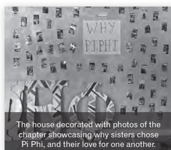
The house decorated with photos of the chapter showcasing why sisters chose Pi Phi, and their love for one another.

On February 3, our chapter held a celebratory ceremony for Chapter Loyalty Day. The house was decorated with pictures of our chapter showcasing why we chose Pi Phi, and our love for our sisters. Usually, Chapter Loyalty Day is celebrated on January 9, which is the birthday of Carrie Chapman Catt. Carrie Chapman Catt was a Pi Beta Phi Sister, and one of the most well-known leaders of the women's suffrage movement, having helped contribute to the passing of the 19th amendment.