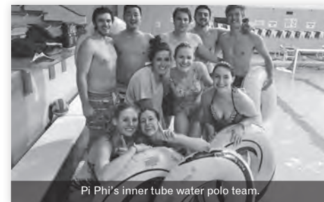
Pi Phi's inner tube water polo team.