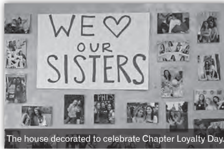
The house decorated to celebrate Chapter Loyalty Day.