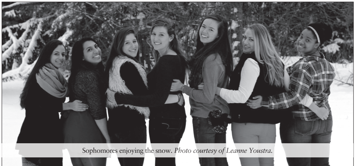
Sophomores enjoying the snow.

And with that, I encourage you all to keep in touch. It will be amazing to see how NY Delta grows especially with the addition of a new member class.