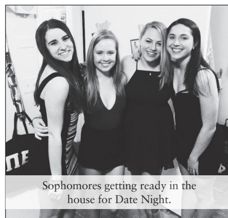
Sophomores getting ready in the house for Date Night.