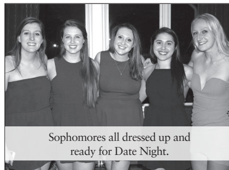
Sophomores all dressed up and ready for Date Night.