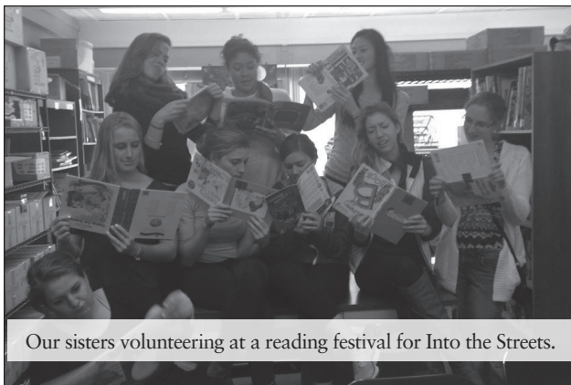
Our sisters volunteering at a reading festival for Into the Streets.