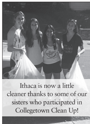
Ithaca is now a little cleaner thanks to some of our sisters who participated in Collegetown Clean Up!