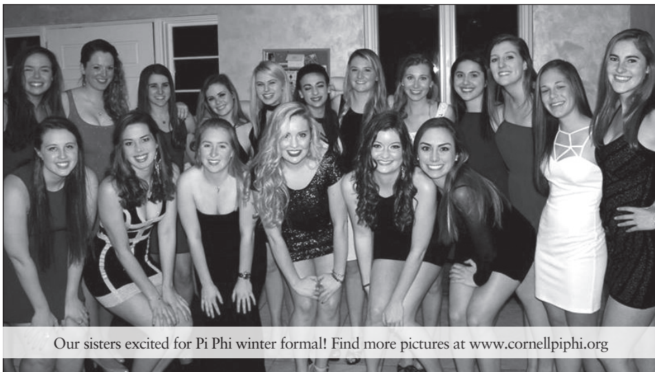
Our sisters excited for Pi Phi winter formal! Find more pictures at www.cornellpiphi.org

The Rochester Club visit reminded us all of what it means to be a Pi Phi and how lucky we are to have such a strong sisterhood. We are looking forward to strengthening our bond with the club in the coming years, and we are so happy that they were able to share their memories and time with us.