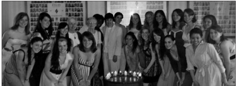
An alumnae brunch at NY Delta.