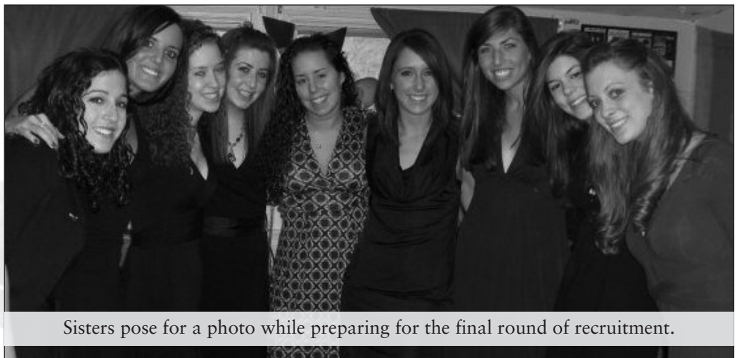
Sisters pose for a photo while preparing for the final round of recruitment.

New York Delta was a once-in-a-lifetime experience. The New York Delta Chapter has a proud and storied history at Cornell and continues to attract the highest quality women who exemplify the characteristics of our founding members. Please honor it today with your generous gift.