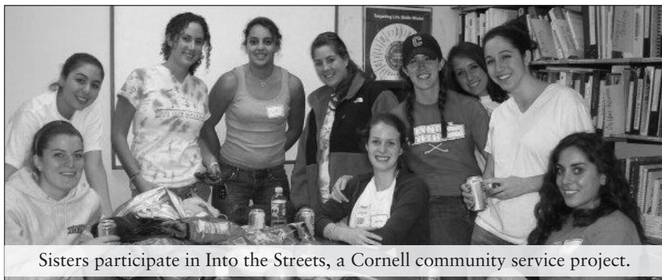
Sisters participate in Into the Streets, a Cornell community service project.

And our entire house took part in Cornell's Relay for Life event. Each pledge class made a separate team for the event, raising $5,300.