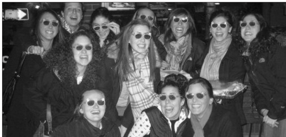
Pi Phi celebrate a sister's birthday.