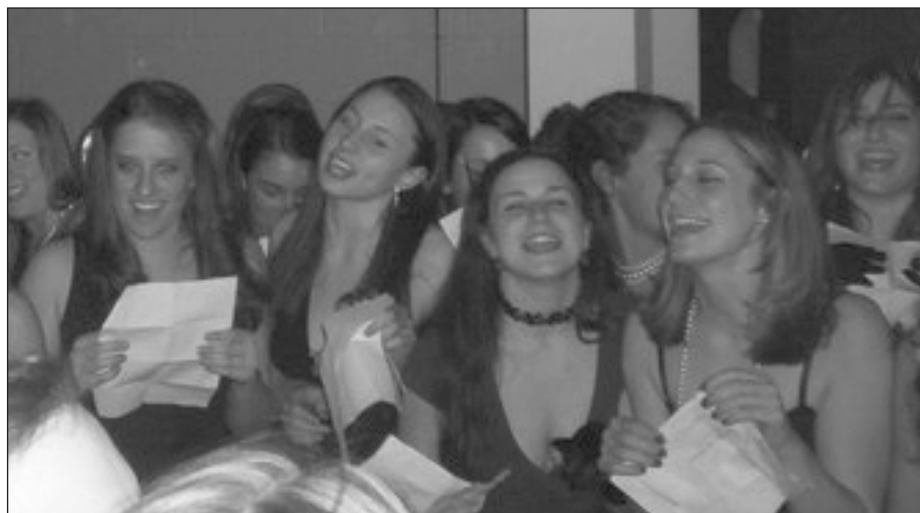
Some of our newest sisters gather to sing traditional Pi Phi songs.

We value tradition here at Pi Phi, and we were thrilled to uncover and learn of so many traditions—ceremonial, social, and sister-to-sister—we could reinstate here in 2006. We are excited to implement the new ideas that we have and are glad to pass them on to our new members. We plan to keep these scrapbooks on