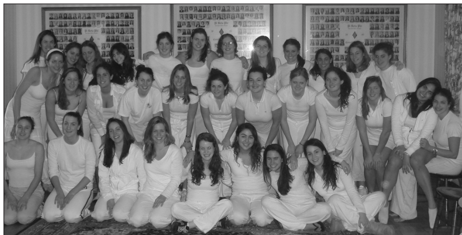
Our newest members gather for a picture on bid night.

The new girls also had the opportunity to come to the house for dinner every Tuesday night, so that they could enjoy some of our chef's great cooking and hang out with some of the older girls. The